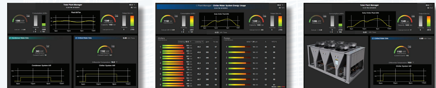
The graphic elements of the Carrier ChillerVu system's energy dashboards can be easily modified to match your specific HVAC system components... regardless of chiller plant size.